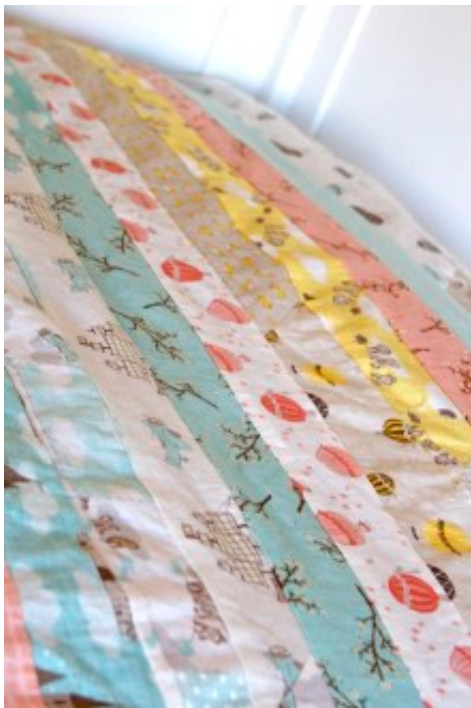
Quilt sewn by Kathryn's daughter

*Take-away lesson: Our take away from Kathryn's home is to rethink your storage spaces. Practical but beautiful storage options can be subtle rather than dominating a room, while storing all that stuff that many of us tend to accumulate. We particularly loved the use of the IKEA Besta system in the living room. We also loved the lighting choices in this home and the hint of 80's retro in the lighting fixtures. Some reminded us of the entryway light fixture in Paula and Clif Taylor's home . Smoky lamps are apparently on their way back!