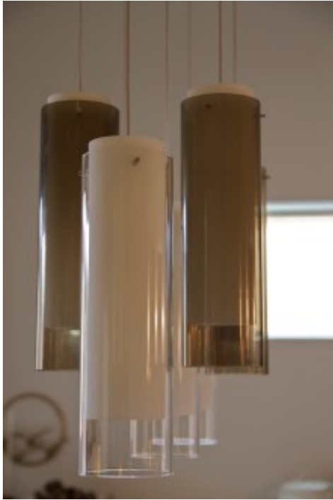
Lights from Tech Lighting

Tucson treasures: “I absolutely loved the market at Mercado San Agustin over the holidays. There were so many great local vendors and artists. I also love the Metal Arts Village where I had my studio for so many years. There are some really talented artists there. Tucson is a very exciting place to be these days. There are so many designers and artists and architects that are doing incredible work.”