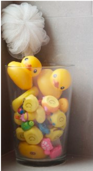
Minda's rubber duck collection