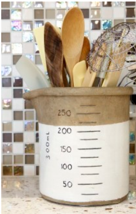
Beaker from Pottery Barn