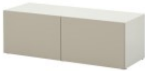
IKEA Besta system

And try these lookalikes we found (contains Amazon Affiliates):