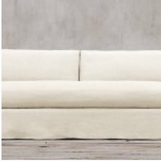
Restoration Hardware Sofa

From left to right: Ikea Besta system, cabinets start at $50 at Ikea ; Alina Pendant lights $453.60 from Tech Lighting at Amazon ; Legrand light switches $49.98 on Amazon ; Belgian Track Arm Sofa from $1995 from Restoration Hardware